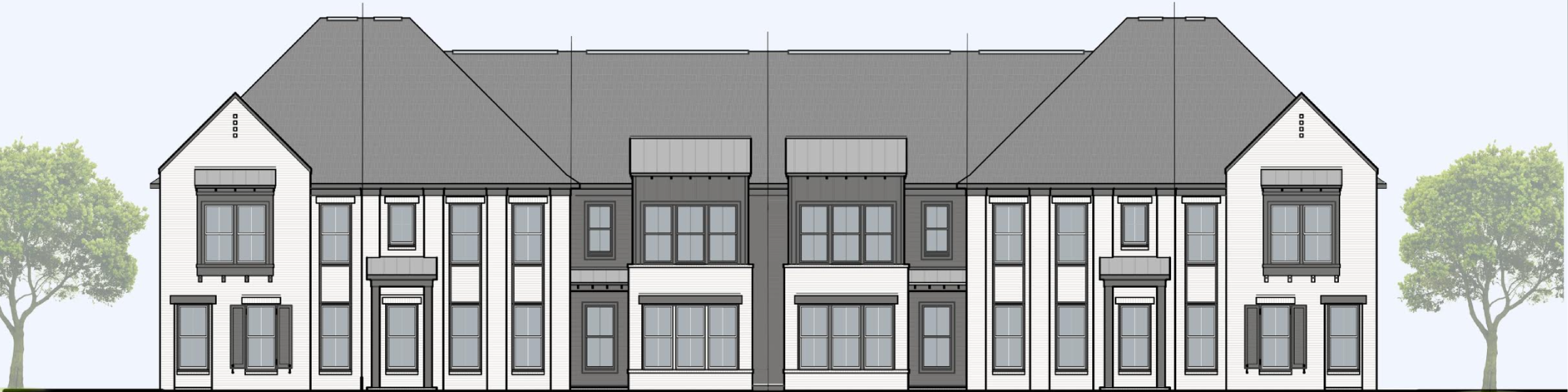
The Reserve At Oxford Farms GROUND FLOOR